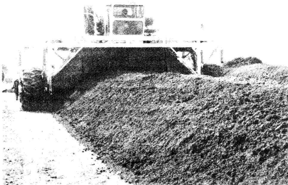
Open-air windrow composting operation near Los Angeles, California.