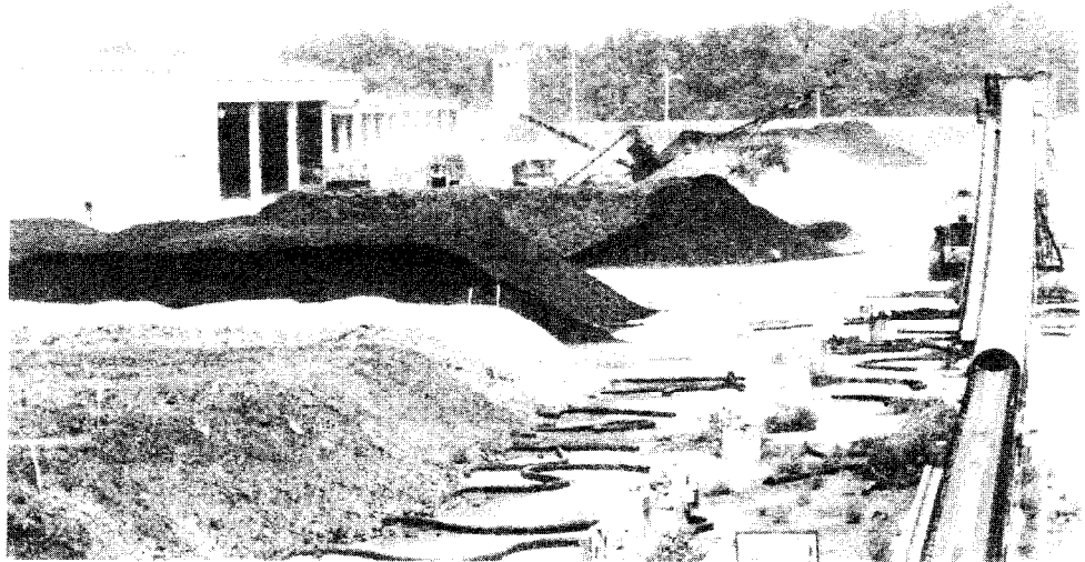
Composting can eliminate pathogens in biosolids (Columbus, Ohio).

The Part 503 rule gives the permitting authority responsibility for determining equivalency. To be equivalent, a treatment process must be able to consistently reduce pathogens to levels comparable to the reduction achieved by listed PFRPs. The process must be equivalent in its ability to achieve Class A status with respect to enteric viruses and viable helminth ova as long as it is operated under the same conditions that produced the required reductions.